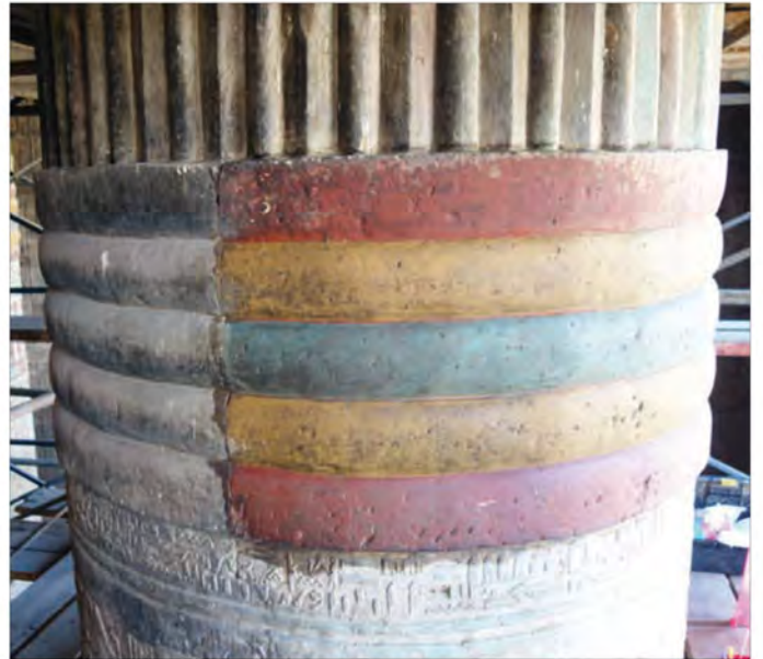
LEFT: Revealing the colours of a hieroglyphic inscription on column no. 7.