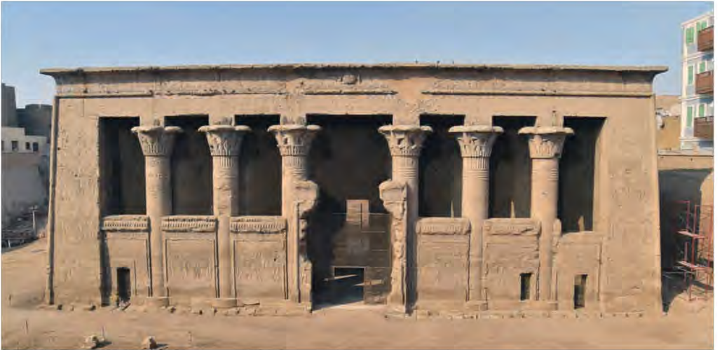
ABOVE The façade of the pronaos of Esna.