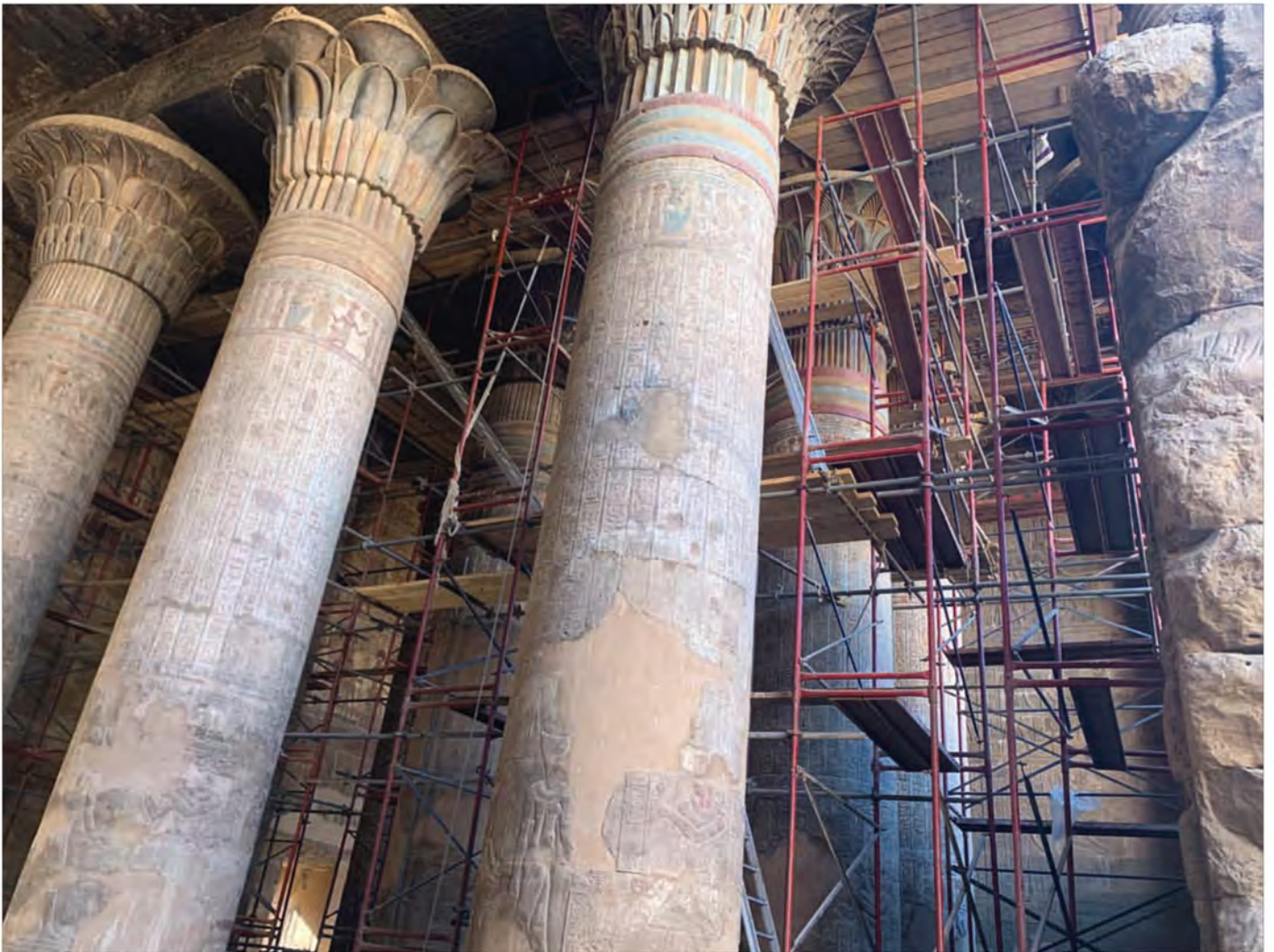
BELOW: Esna Temple's pronaos (hypostyle hall) with scaffolding for the restoration work. Note the variety in the capitals, with different designs used for adjacent columns.