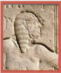
A Good Old Age

The History, People and Culture of the Nile Valley