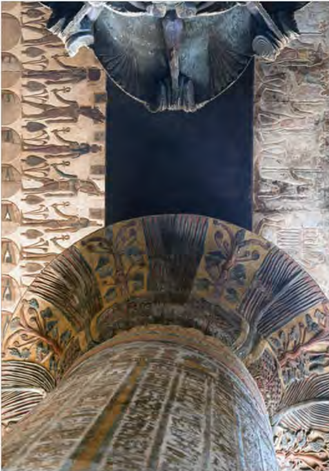
ABOVE: A new inscription, until recently covered with soot, has been discovered on the lower surface of architrave A in the blackened space between columns no. 7 and 13.