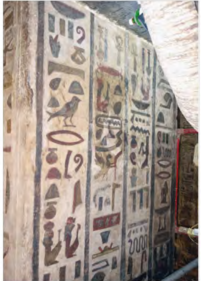
ABOVE: After the cleaning process, the new inscription was revealed. The photograph here is shown on its side so that the text can be read more easily.

in Tübingen, and includes an analysis of the impact of the colouration within the ancient decorative scheme. At this point, with only a small part of the decoration revealed, it is apparent that a study of the colouration offers a rare and innovative approach to research into Graeco-Roman Period temple decoration: the combined material analysis of figures and texts in relief and (now) in paint, as well as the textual evidence, shows they all formed part of one integral decoration pattern.