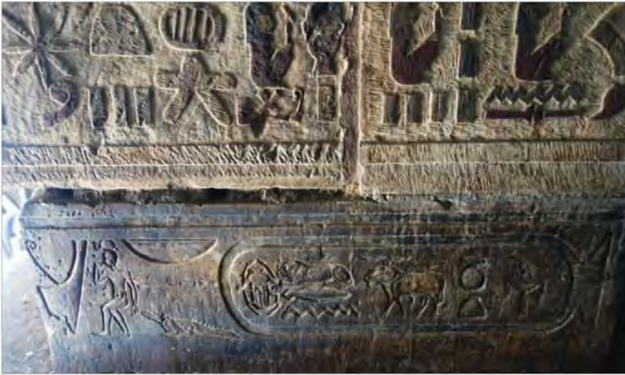
ABOVE and BELOW The cartouche of Emperor Trajan (AD 98-117) on the northern side of the abacus of column no. 1 before (above) and after (below) conservation treatment.

of Antiquities (now Ministry of Tourism and Antiquities) and the Egyptological Institute of the University of Tübingen in 2018. Previously, in the 2000s, the Ministry cleaned some of the western interior wall, and the new project offered the opportunity to resume work on a large scale and with an enlarged focus.