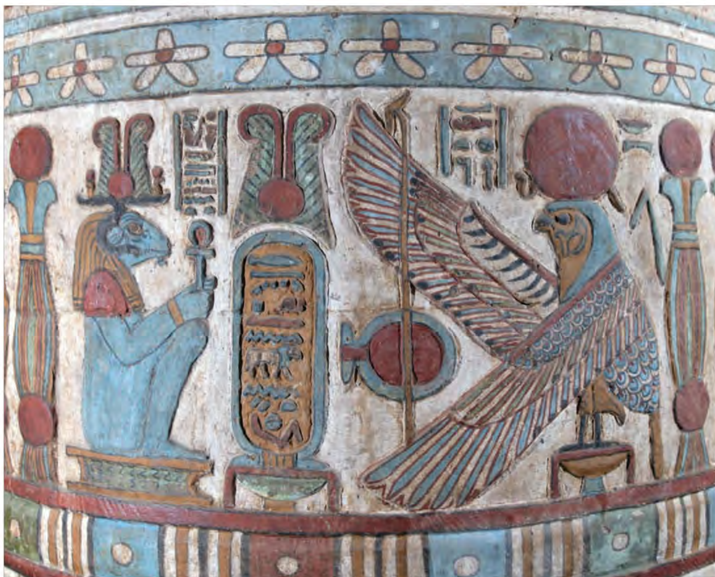
ABOVE: The frieze on the upper part on column no. 7 after conservation. The cartouche of Emperor Hadrian (AD 117–138) is accompanied and protected by Khnum, Lord of Esna (left), and the falcon Behedety (right).