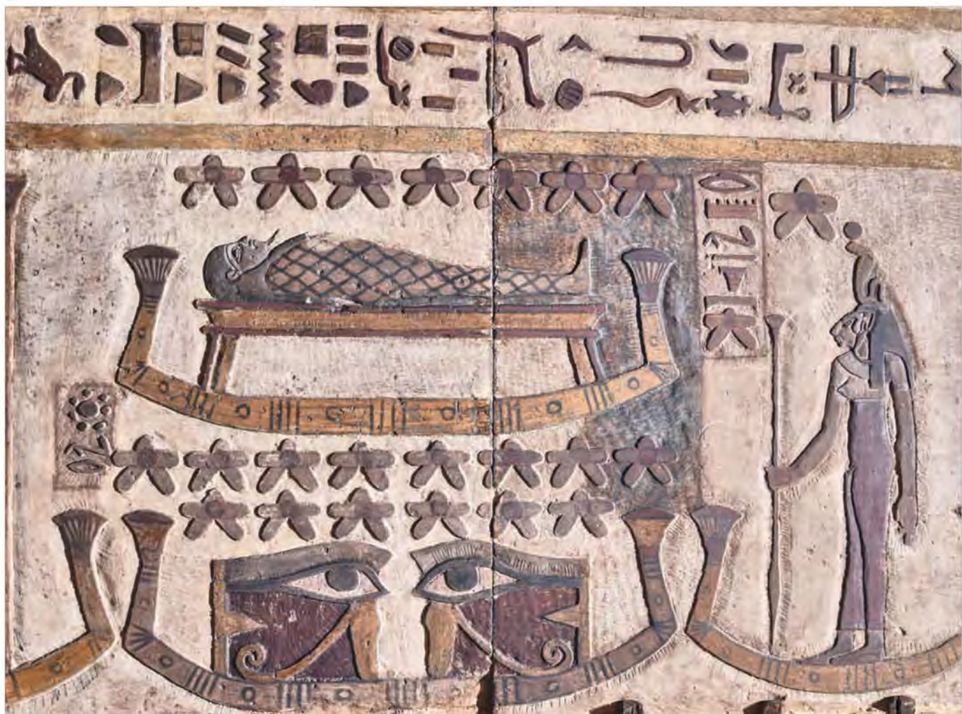
ABOVE Decans no. 30 in the form of a mummy on bier (above) with seven stars and no. 31 in the form of two wadjet-eyes in a barque (below) with 14 stars; Travée B, northern register.

this symbolism is not in accordance with the actual position of the cobra in the southern part of this travée . The connection only becomes clear and logical by taking into account the entirety of the ceiling where Travée A is the northernmost, and thus a perfect position for the crown goddess of Lower Egypt.